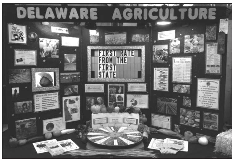
Students and teachers represent District well

(HARRINGTON, DE) The Smyrna FFA Chapter shined like the Summer sun by having a successful showing at the 2013 Delaware State Fair, with numerous recognitions at the Delaware FFA Awards Breakfast held on July 26.