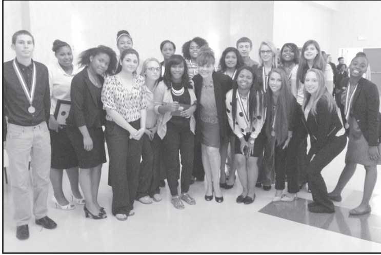
Smyrna had quite a day at JDG's DCA Competitive Events Awards Ceremony! Smyrna High School students competed against 23 other schools from around the state; Smyrna

High School students collected three 1 st place, four 2 nd place and two 3 rd place awards. All of our staff and students at SHS are extremely proud of them.