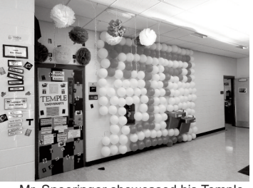
pride for all to see

members and volunteers from local organizations. Teachers discussed their college experiences, as well as decorated their doors to showcase over 60 schools. Every student who applied to a college or